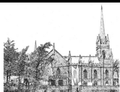
St. Brendan's, Carrig

Sunday Mass Times Vigil: 7.30 p.m. Sun: 8.30 a.m., 10.30 a.m. and 12 noon